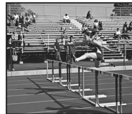
TRACK UNLEASHES ITS' HORSES

PLACENTIA'S OLDEST CONTINUOUSLY RUNNING NEWSPAPER, EL TIGRE IS A STUDENT-RUN NEWSPAPER IN THE PLACENTIA-YORBA LINDA UNIFIED SCHOOL DISTRICT