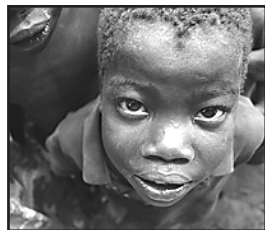
"Change for Change" Invisible Children