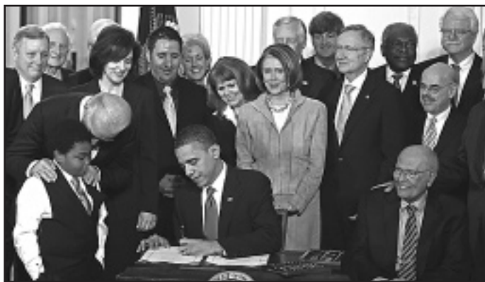
PRESIDENT OBAMA SIGNING THE HEALTH CARE REFORM BILL.

Paying for this $938 billion bill will require taxes and even more changes. Government spending on Medicare will be reduced by hundreds of billions of dollars, to cover the costs. At the same time, there will be the imposing of new taxes. This includes a 40% levy on certain high-priced insurance policies.